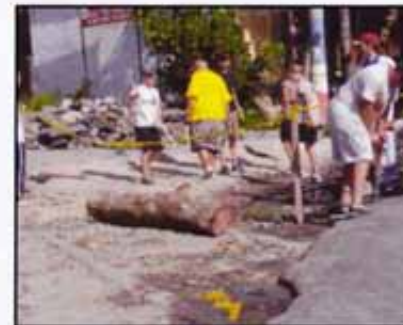
A team rebuilds entrance to the Home