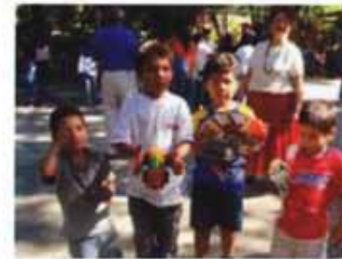
Some teams bring toys for different genders and ages.