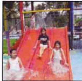
Teams sometimes take our kids to a water park for a day