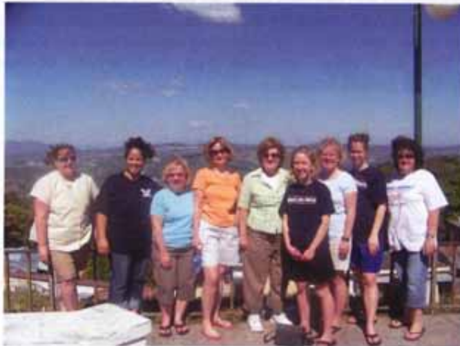
TEAM ON A VOLCANO

Food is served in El Comedor (dining hall) three times per day. Most of the time a bell will ring when food is served. Breakfast is at 6 am on weekdays when the children are in school and at 7:30 on the weekends or when school is not in session. Lunch is served at 12:30 pm. Dinner is served at 5:30 pm every day. All times are subject to change.