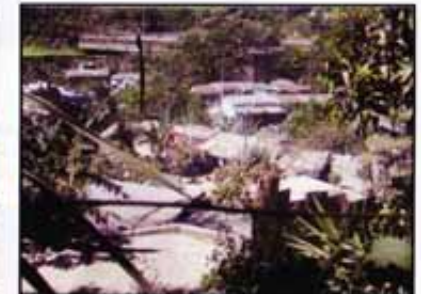
Oasis Community where team evangelizes