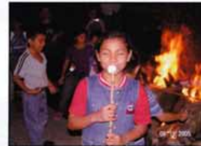
One team brought Marshmallows

Salvadoran food is inexpensive, simple, occasionally unhealthy, and sometimes delicious. Pupusas (pronounced poo-pooses) are the Salvadoran main-stay, although fast-food restaurants make hamburgers and pizza a competitive second. The country also has tons of fresh, exotic fruit like pineapple, mango, papaya, watermelon, etc. Pupusas are 4" round thick tortillas" filled with soft white cheese, beans, pork, or all 3. They are made out of rice or corn flour and cost 50 to 75 cents each. Mostly traditional Salvadoran food is served at the Home. This includes beans, rice, tortillas, soup made with chicken or beef, tamales, eggs, local vegetables, bread, local fruits, salad, etc.