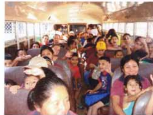
Air conditioned buses rent for up $ 75 to $160 for a day, with driver. Teams can rent one for their free day.