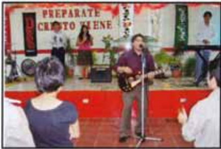
Your Team can participate in our church services