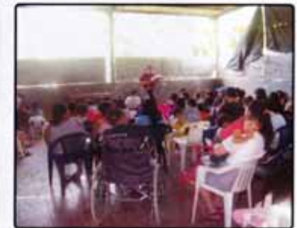
Teaching the gospel at Oasis Community