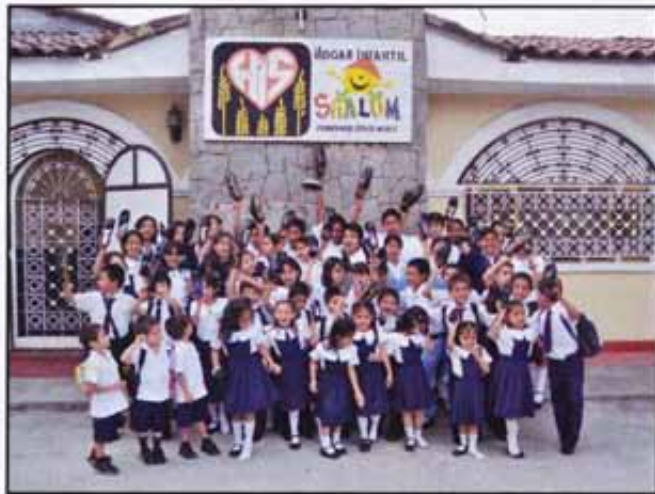
Shoes for all costs $ 1200 purchased in San Salvador