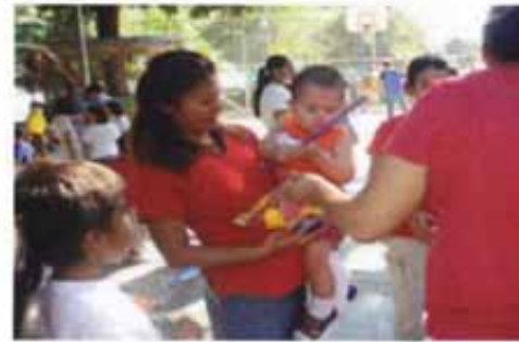
These are activities of some past teams. Some teams do more than others, and some don't do anything extra.