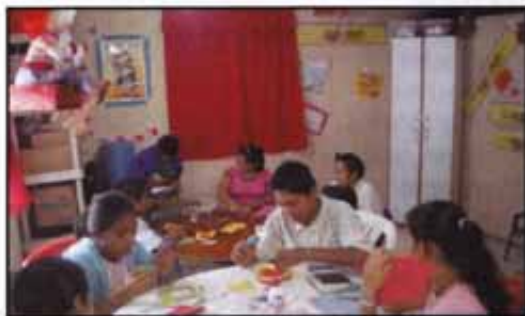
A TEAM TEACHES A CRAFT TO OUR KIDS

Sun glasses Hat, bandana, etc. Bag for dirty/wet clothes Photos of home, family, friends, pets, etc. Journal/Diary Several books to read Safety pins, small sewing kit Spanish-English dictionary Your own dish (at least a bowl) Your own flatware (at least a spoon) Your own cup and/or mug Other items to consider: Musical Instruments Construction tools or auto mechanic tools Sports equipment School supplies (if teaching) 1 lightweight jacket 1 umbrella (during rainy season, APR 15-NOV 1) Insect repellent sun-block Bible (Spanish-English if possible) Stationary U.S. postage stamps Small mirror Razor and shaving cream Water bottle Personal Medications Ibuprofen (Advil, Tylenol, etc.) Camera, film (lots), camera battery Passport and 1 photocopy Backpack or small duffle bag Eye glasses or contact lenses Contact lens solution Addresses and emails of supporters, friends and family