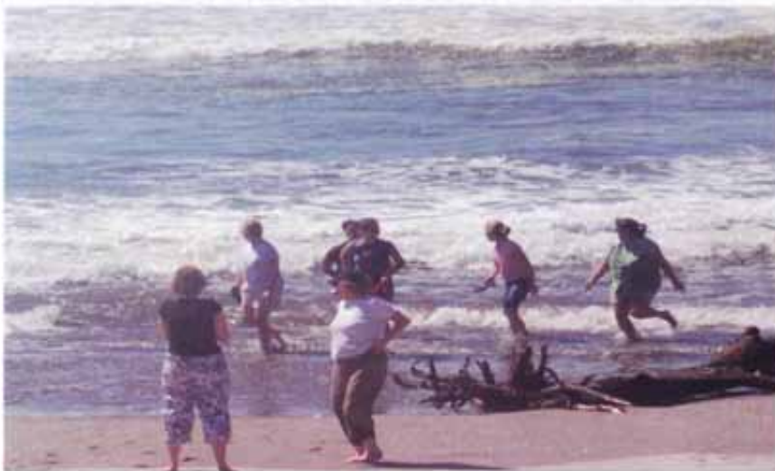
A TEAM ENJOYS THE BEACH 1 HOUR A WAY

Our Mission - The mission of Harvesting In Spanish is to care for the poor, the widows, and the fatherless, while fulfilling the Great Commission